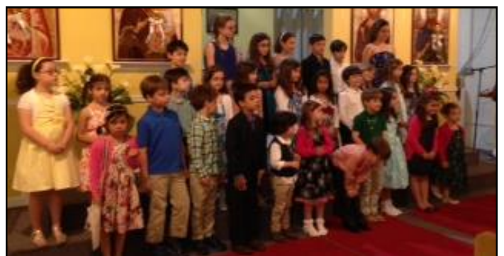
Above: Greek School graduation.