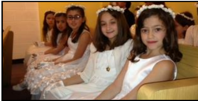
Photos from Holy Week: Myrofores, above, and the carrying of the body of Christ, below.

Mark your calendars for the GOPLC Parish Picnic on June 28, to be held at the Douglass Community Center Pavilion off E. Market Street in Leesburg.