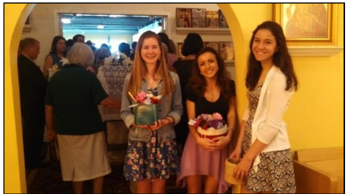
GOYAns passing out flowers for Mother's Day.