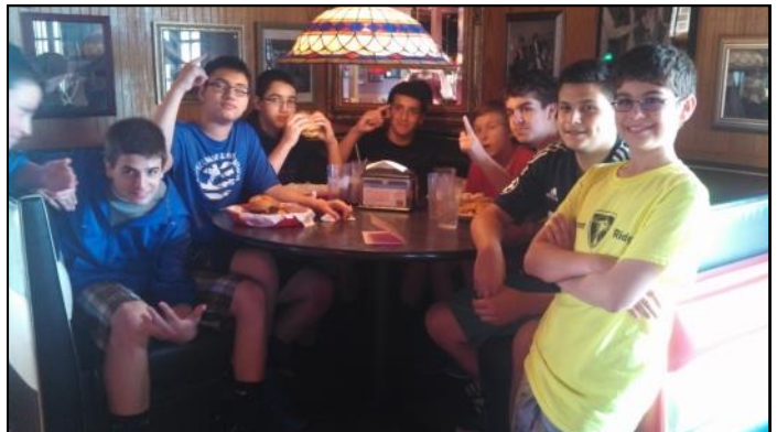
The GOYA Basketball Team enjoying a meal together.