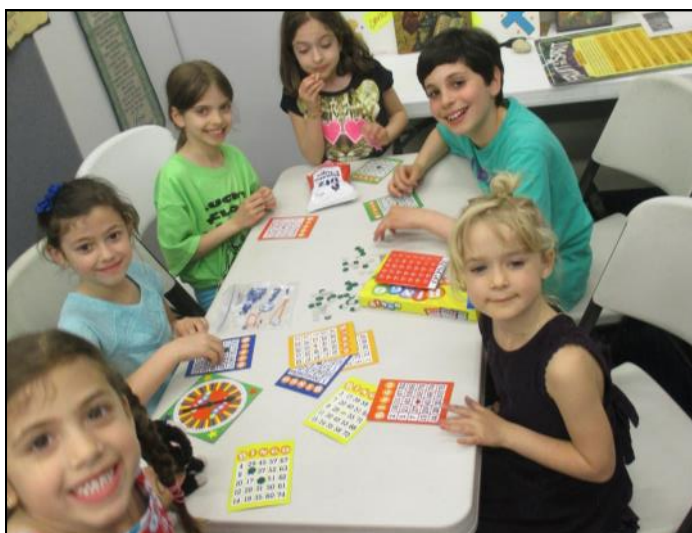
Above: Students enjoying Hope/Joy.