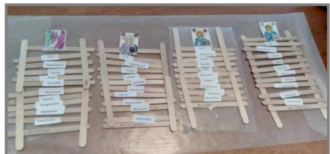
This is an example of the craft one of our parishoners' family made from the 4th Sunday of Lent: St. John the Ladder...Great job!