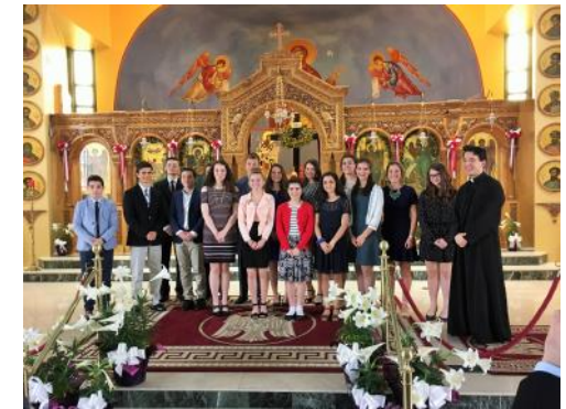
Diocese level Oratorical Festival competition held on May 4, 2019 at St. George in Hamilton, NJ