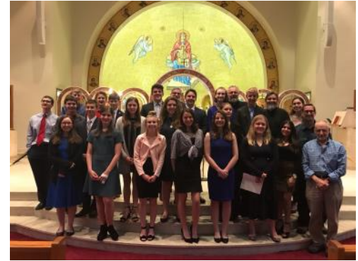
State level Oratorical Festival competition held on April 13, 2019 at Sts. Constantine and Helen in Newport News, VA